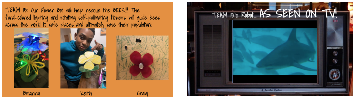
Figure 4: Team Flower’s showcase slides (pictures of team robots and Shark Tank presentation)

(Cunningham & Carlsen, 2014). Engineering pedagogy differs from traditional pedagogies in that it relies on interaction, hands-on activities, consideration of real contexts of application, and promoting creativity (Mbodila et al., 2012; Hayes et al., 2016).