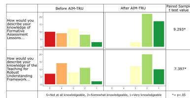
Figure 2. Pre/Post Survey results from Year 1 around knowledge of TRU and Formative Assessment Lessons

A pre/post survey was conducted in order to understand how confident teachers felt about their understanding of the instructional materials as well as the TRU framework. The pre/post survey also asked how frequently they used the resource in their classroom. A paired sample t-test or Wilcoxon signed rank test was used as appropriate considering whether the data was parametric or not. Classroom observations were also taken, with results based on the TRU Math Rubric forthcoming as a part of later work of the grant.